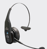
▪ 95ACC0002 Bluetooth® Headset VX1 B350-XT