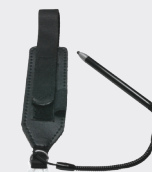
▪ 94ACC0133 Hand Strap (Included with purchase)